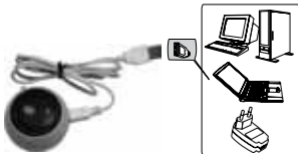
Fig. 3. Accumulator charging