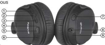
Fig. 1. Headphones design

⑨ LED indicator of active noise cancellation system (ANC)