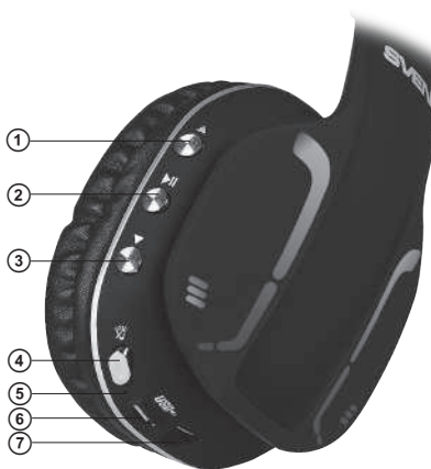
Fig. 1. Headphones design