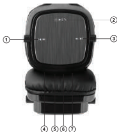
Fig. 1. Headphones design