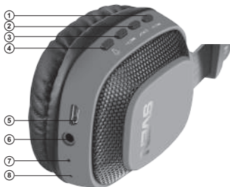
Fig. 1. Headphones design